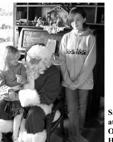
Santa & friends at December's Open House at Harlow House

The family suggests contributions to the Troutdale Historical Society.